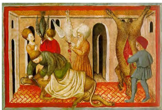
Fig. 11. Jewish ritual slaughter of animals, 15th century

In the second volume of al-Mi'yār , a long chapter is devoted to Navāzil al-ssaydi wal-dhabāih wal-ašhriba wal-dhabāyā (the matters of chase, slaughtering and animal sacrifices). A question that was asked to judge Ibn'Arabi refers to the Christian slaughtering and then the cooking of a chicken: »Is there a right to eat the chicken together with him or to accept it when he offers it as a gift?« (Clearly, there was a custom to mutually offer plates to be taken). He answers: »yes, one has the right to eat because this chicken is his nourishment«. Then, he adds the remarkable sentence: »what they (Christians) think to be ḥalāl within their religion is also ḥalāl for us, except when it is explicitly forbidden by Allah«. 154