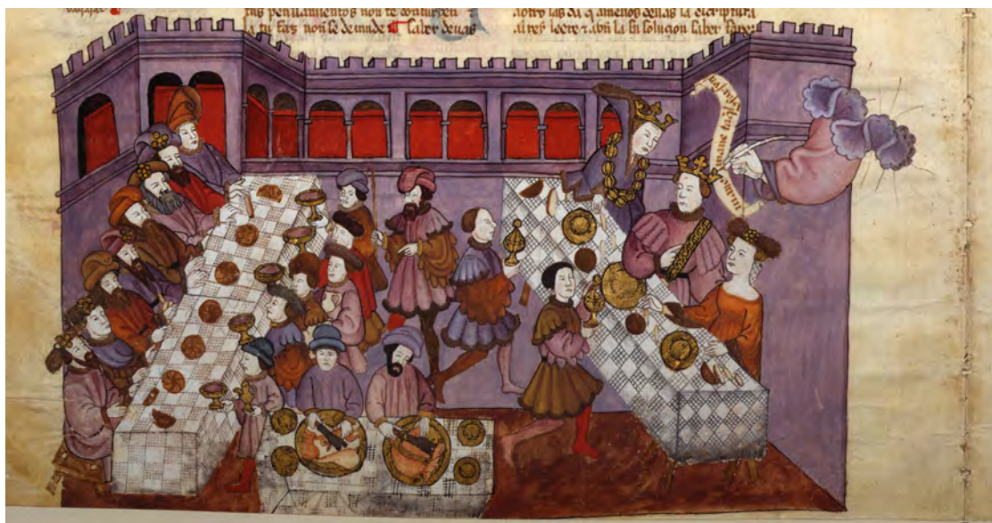
Fig. 12. Muslims and Christians celebrating together, as they used to, for example, in the Alhambra on Christmas and New Year's Eve, Biblia de Alba, 1422–1433, Palacio de Liria, Madrid