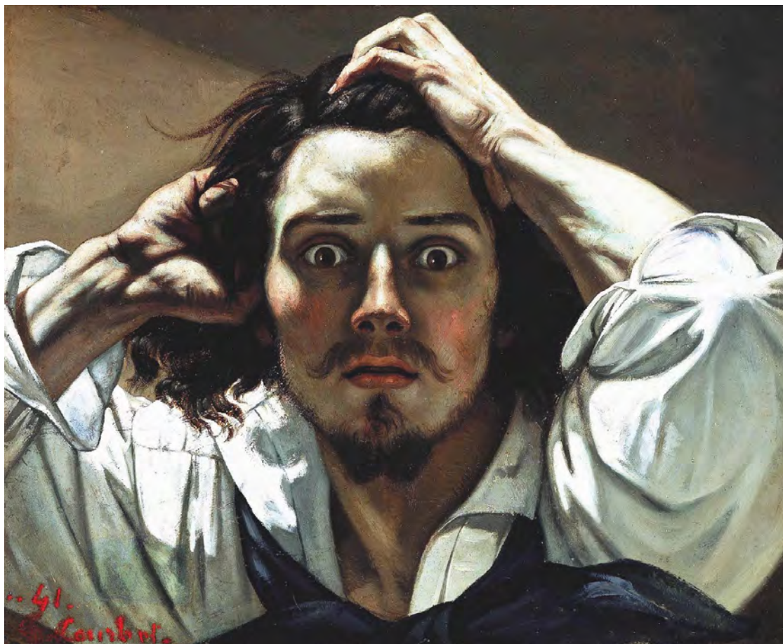
Fig. 16. The Desperate Man, SelfPortrait, 1843–1845, Gustave Courbet

To say »me« or »I« in a reflecting mirror and embody that narcissistic search by reproducing one's proper face 200 on a canvas 201 is unthinkable in Islam. One is avoiding the view of one's own face, perhaps out of fear of finding in it the face of some categories of others: especially in the domestic sphere, 202 those others, who remain under