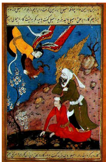
Fig. 17. Iranian Miniature of the sacrifice of Ismael, son of Abraham, Illustration of Qesas al-anbiyâ, Qazvin, Iran, end of 16th century