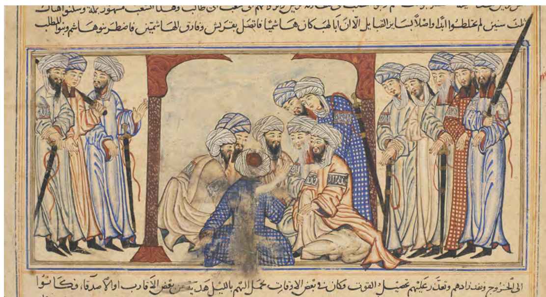
Fig. 10. The consultation of Quraysh? Jāmi‘al-Tawārikh, Rashid al-Din, Iran, 14th c.

This corpus constitutes what is called the sīra nabawiyya (life and acts of the Prophet). However, these »biographies« of the Prophet are not biographies in the proper sense of the word, even if many works by orientalist use them in the same sense as sīra . This can be seen in the works of Rodinson, Horowitz 80 and Blachère. 81 Montgomery Watt