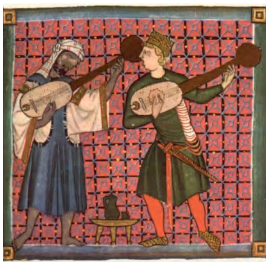
Fig. 13. School of Alfonso X, later half of the 13th century, Muslim and Christian Musicians

Is it necessary here to remember that the studies on Convivencia very often neglect the situation of women. However, for all reports of neighborhood, festivities, and culinary traditions, child-raising women are the main actors. The ḥammām ( Baños Arabes ), for example, is not a confessional space in Islam. »The existence of public bath houses in the cities of medieval Spain might be seen as one of the most potent markers of an urban culture shared between Muslims, Christians, and Jews. All three religious groups patronized the public bath houses for reasons of hygiene, health, and sociability«. 160