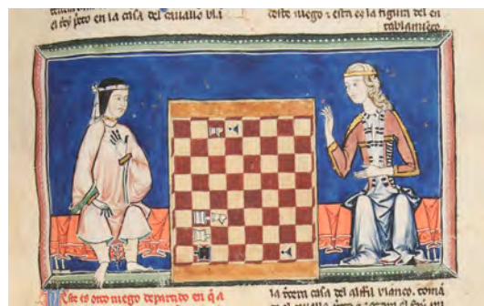
Fig. 14. An Arab and a Spanish woman playing chess, Alfonso X, libro de los juegos, 13th century

It is also mainly due to women that certain rituals celebrating the anniversary of the Prophet of Islam, Muhammad, seem to be influenced by the celebrations in Christianity. Several fatāwā relate these facts and insist on the parallelism of Christian influence. In a fatāwā , Ibn'Abbad considers the new rituals as follows: »to illuminate candles, wear new and beautiful cloth, decorate homes, do everything that is doing joy to ears and eyes are all mubāḥ «. 161 This therefore has to be regarded as a Muslim celebration par excellence .