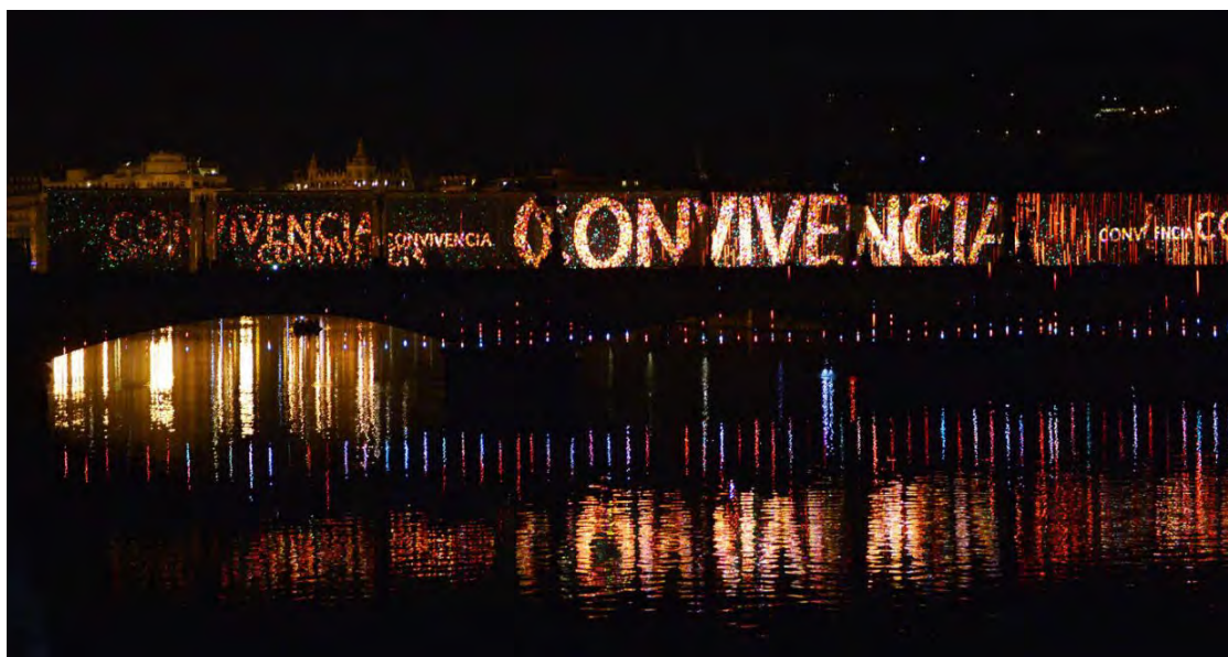
Fig. 3. Puente María Cristina, inauguración Capitalidad Europea

why they were subject to Islamic law from a perception of protection rather than submission. Lastly, the question still remains as to why Muslims were obligated to liberate dhimmī captured by the enemy and pay their ransom just as they would for a captured Muslim.