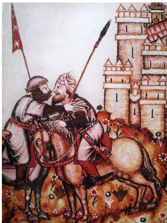
Fig. 6. Muslim and Christian knights embracing in greeting

Certainly, the conceptualization of Convivencia itself is subject to considerable difficulties of perception, first according to the disciplinary lens and then to methodology. Nevertheless, the fact remains that it represents the connection to Iberian Islam and more precisely to the »theory« of dhimma which merits more reflection and research. The present essay is conceived in this vein.