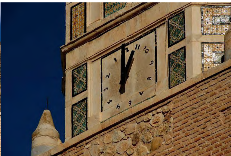
Fig. 4. The Great Mosque of Testour Fig. 5. Detail of the Great Mosque of Testour

smells and flavors of the Andalusia of yesteryear. This mosque was constructed in the early 17 th century by Muhammed Tagharino, a Morisco with origins in Aragon who arrived in Tunisia with the second wave of Andalusian immigration. The first wave arrived in 1610 and built the first nucleus of the city along with its first quarter Rḥibat al-Andalus . It was followed by the quarter of Tagharino, built at the same time as the mosque, and the quarter of Ḥara , occupied by the Jewish community that accompanied the expelled Muslims in their painful fate. Aside from tiles and bricks fabricated locally by Andalusians, Tagharino used stones extracted from Roman ruins located in situ to construct the Great Mosque. This elegant and impressive mosque rises into the sky, with its octagonal minaret in the image of towers dominating ancient Spanish churches, with two stars of David – a testament to the diversity of the population of Testour – tile roofing, a sun-dial in the middle of the patio that indicates the hours of