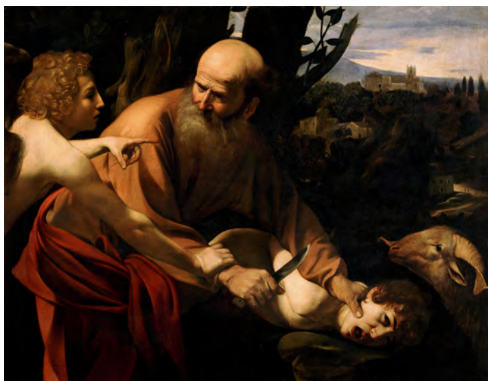
Fig. 18. Sacrifice scene of Isaac, son of Abraham by Caravaggio, 1598

severe surveillance, domination and sometimes punishment. It is about the slave, the castrated ( al-khasiy ); the young; the free thinkers of innovation ( zindiq ); and above all the female. 203 The latter constitute the internal and intimate otherness par excellence . Women represent a border not to be crossed by the dhimmî , because to him or to her it is forbidden to marry, to practice connubium . Nevertheless, the figure of dhimmî has played a decisive role in the relationship of the Islamic ego to alter ego , because among all those figures of otherness, or better against those categories, the dhimmî is part of the inner and exterior frontier of the Islamic Self. It resides with him at the interior of the same territory. But beyond the explicit economic aspect of this cohabitation ( ġizya ), there has been another role, that of the alter ego in order to erect an ultimate frontier, beyond which one is not allowed to adventure. The dhimmî creates hence the forbidden territory ; it represents »an arc between the law and its transgression or between a subject endowed