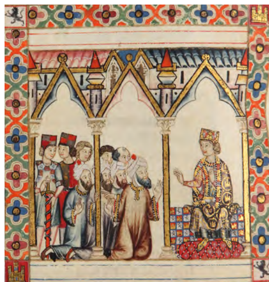
Fig. 15. Alfonso X dialoga con médicos árabes, »La Medicina en Al-Andalus«

Further, the degree of this integration of the ḍhimmi in the spirit of solidarity reached its stron-