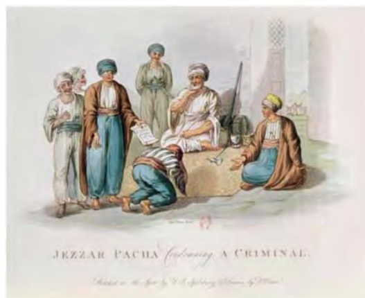
Fig. 7. Ahmad al-Jazzar Pacha 1720–1804, governor of Saint John of Acre, condemning a criminal; on the left a Jew as an associate judge