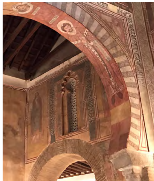
Fig. 2. Iglesia de San Roman, Toledo