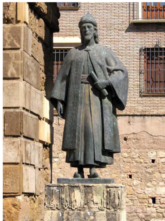
Fig. 8. Monumento dedicado in 1963 a Ibn Hazm en la Puerta de Sevilla, Córdoba

stinctively stops at a certain limit: the respect for Jews and Christians as holders of Scripture ( ahl al-kitāb ). His polemic Risāla (Epistle/Letter), in which he vehemently refutes the critique of the Jewish minister of Granada, Samuel Ibn Nagrila, regarding contradictions in the Quran, is testament to this.