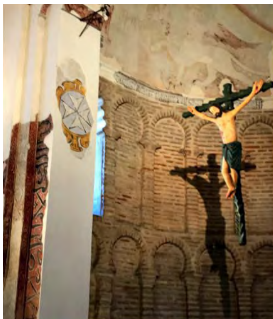
Fig. 1. Mezquita-Iglesia del Salvador, Toledo